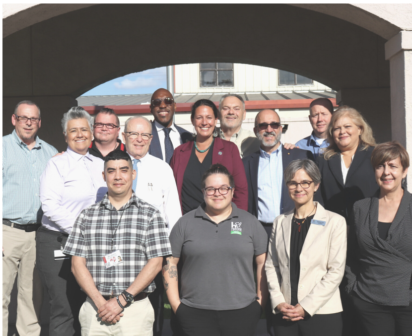
US Department of Education, Mayor's Office for Adult Literacy (MOAL), Wesley Community Centre